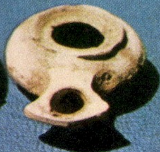
Vasi in ceramica