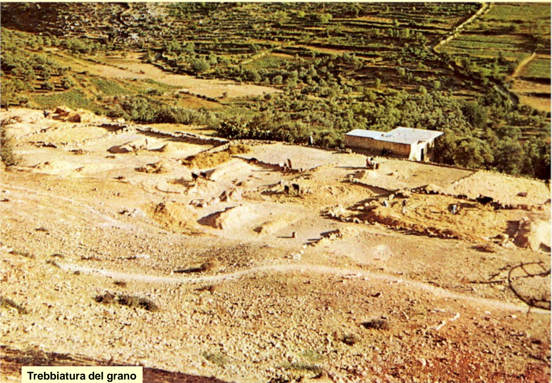
Trebbiatura del grano