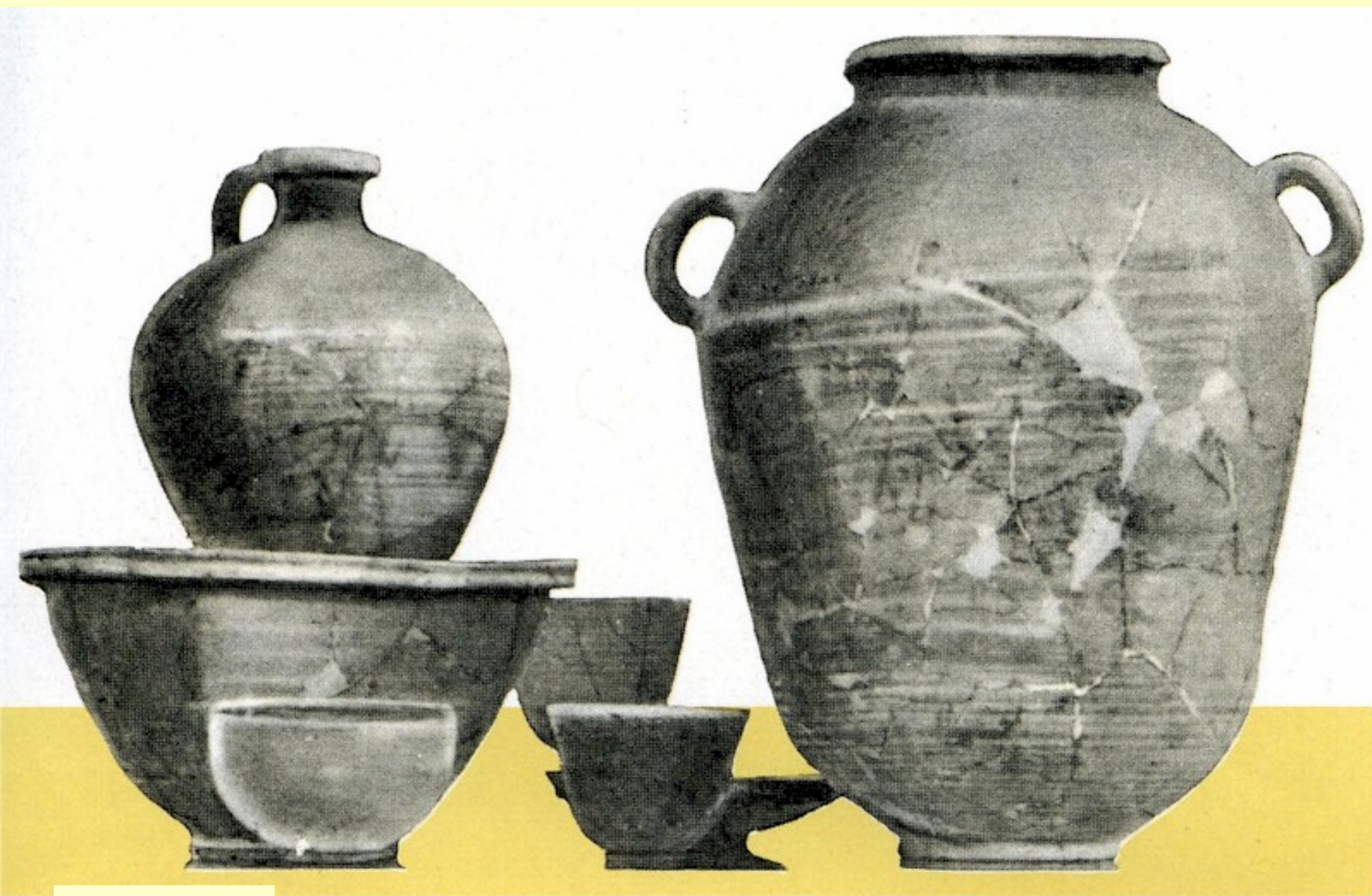
Vasi e stoviglie