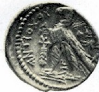
Sicli d'argento, della zecca di Tiro