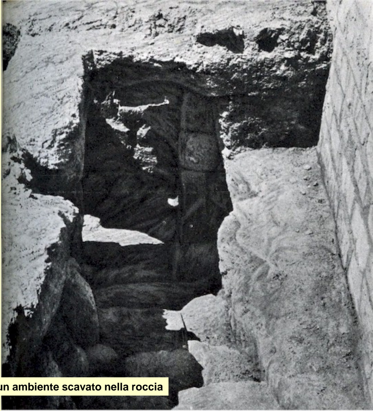
Ingresso a un ambiente scavato nella roccia